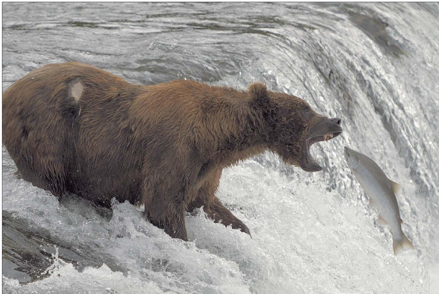
ABOVE, BELOW, RIGHT: Brown bears have the right of way in Katmai National Park. Animals congregate at the falls where their hungry cubs and tourists watch as sockeye salmon leap into waiting jaws of adult bears.

While Katmai today is most famous for bears, the park was originally formed to protect the