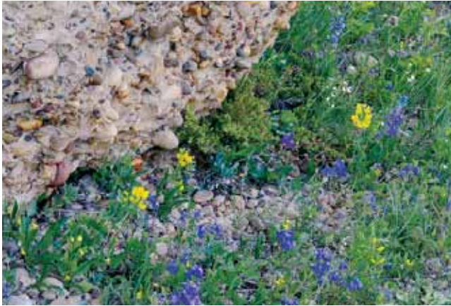
Left: Wildflowers such as low larkspur and golden bean add a splash of colour at the base of the conglomerate cliffs. Opposite: Hidden conglomerate cliffs.