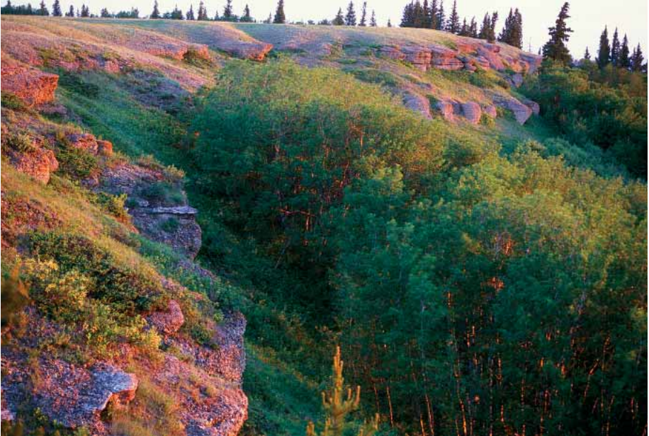
The first rays of the rising sun strike the conglomerate cliffs.

W e would be hard pressed to find a part of Saskatchewan with as many fabulous scenic viewpoints as in the Cypress Hills. This spot ranks among the best, not only in the Cypress Hills, but anywhere in Saskatchewan.