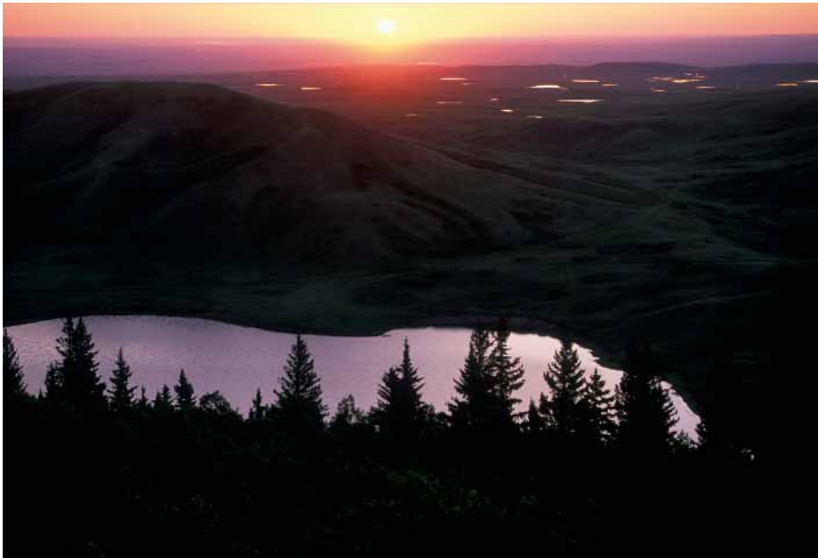
Standing on the rim of the conglomerate cliffs, you watch the sunrise over Adams Lake.