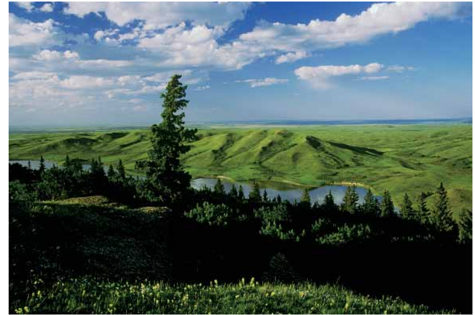
View over Adams Lake just before sunset.

slightly to the northeast, clearing the horizon over the lowest part of the terrain. When the first light shines up and floods the east-facing cliffs, the reddish rocks suddenly become saturated with a lustrous crimson glow. The magical transformation continues for the next few minutes as nuances of colour change with the rising sun.